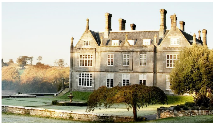
Picture of Kitley House Hotel